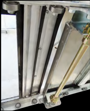
Rear Trap Crossmember View

In 2008, we took an unprecedented step by opening our very own research and development center dedicated to improving and testing our products. Having our focus on one market allows us to provide you with a high quality product that is backed by a warranty that's unmatched in the industry.